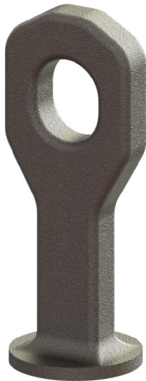
P140 Forged Foot Anchor