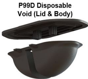
P99D Disposable Void (Lid & Body)