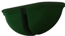
P99/P99D Void Adapter Clip