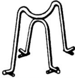
Stainless dowels on chairs over 3"