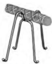
High Chair w/ turned up leg