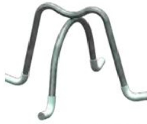
Plastic dipped legs available