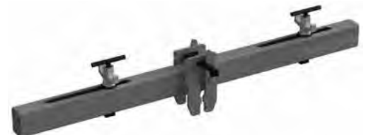
F56914 - Stacking Clamp