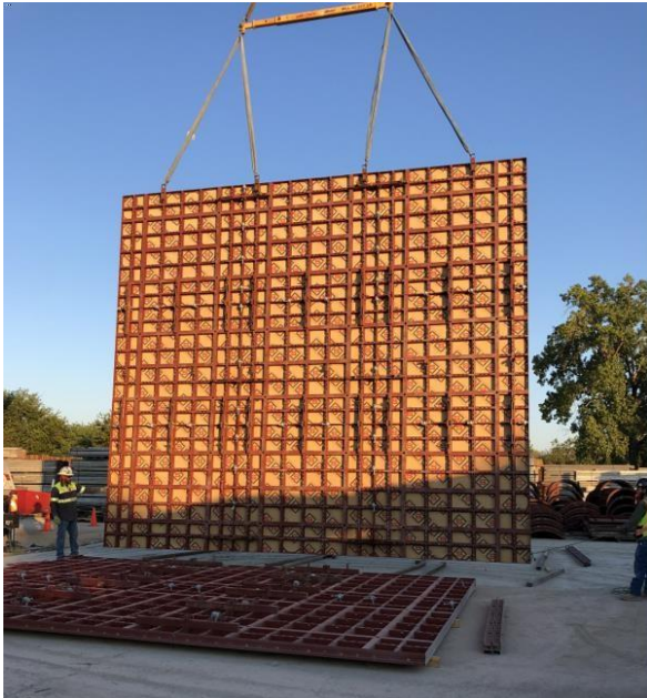
PHOTO: 3 Panels Wide x 3 Panels Tall