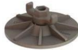
B12ASW - Swivel Wing Nut w/ Plate