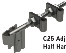
C25 Adjustable Half Hanger