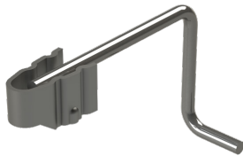
C24 Pres-Steel Half Hanger

REDUCED PRICING on select* bridge overhang products