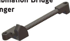
C61 Combination Bridge Deck Hanger