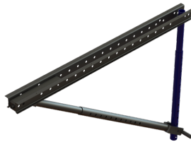
C49 Bridge Overhang Bracket