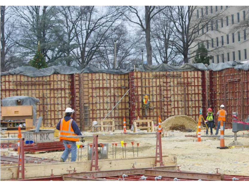
The Sym-Clamp allows crews to quickly assemble or reconfigure gangs.

Additional product information is available online at www. daytonsuperior.com. Contact your Dayton Superior representative at 888-977-9600, or send an email to info@ daytonsuperior.com if you would like to discuss how these or other innovative systems can make your construction projects more productive.