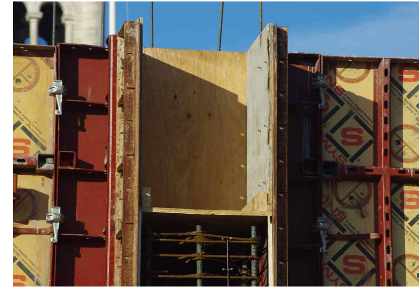
The contractor was able to gain boxout access by using Steel-Ply on at least one face of every pilaster because of its compatibility with Sym-Ply.

Learn more about the Sym-Ply forming system online at www.daytonsuperior.com/symply