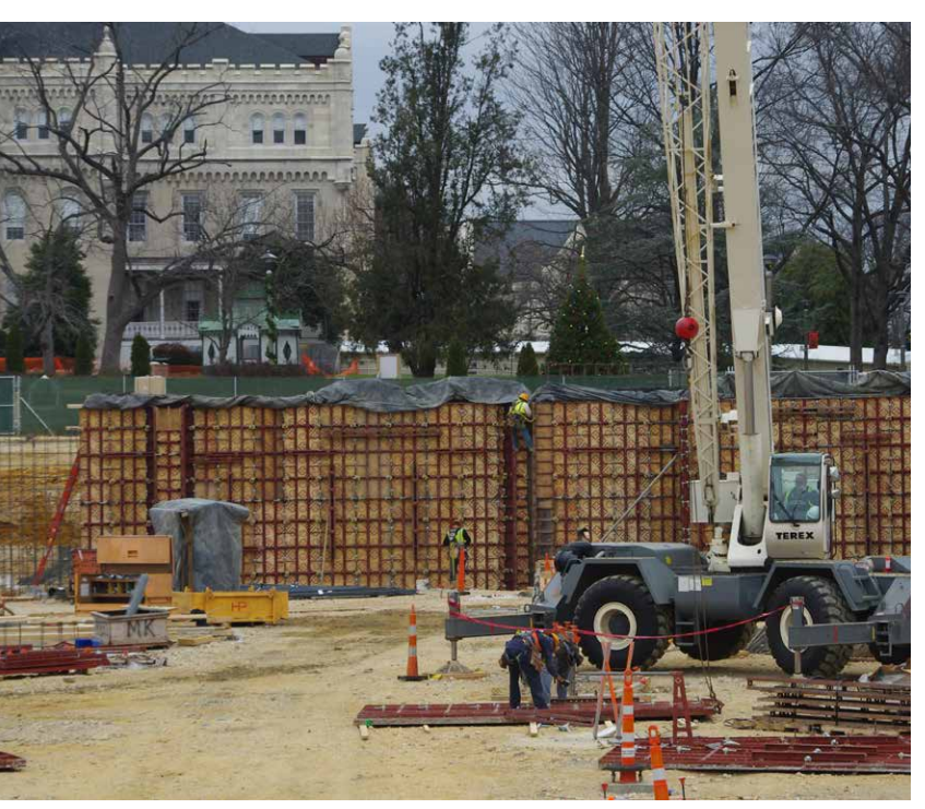
Ganging forms allows contractors to position large blocks of forms at a time, speeding set-up and take-down procedures.