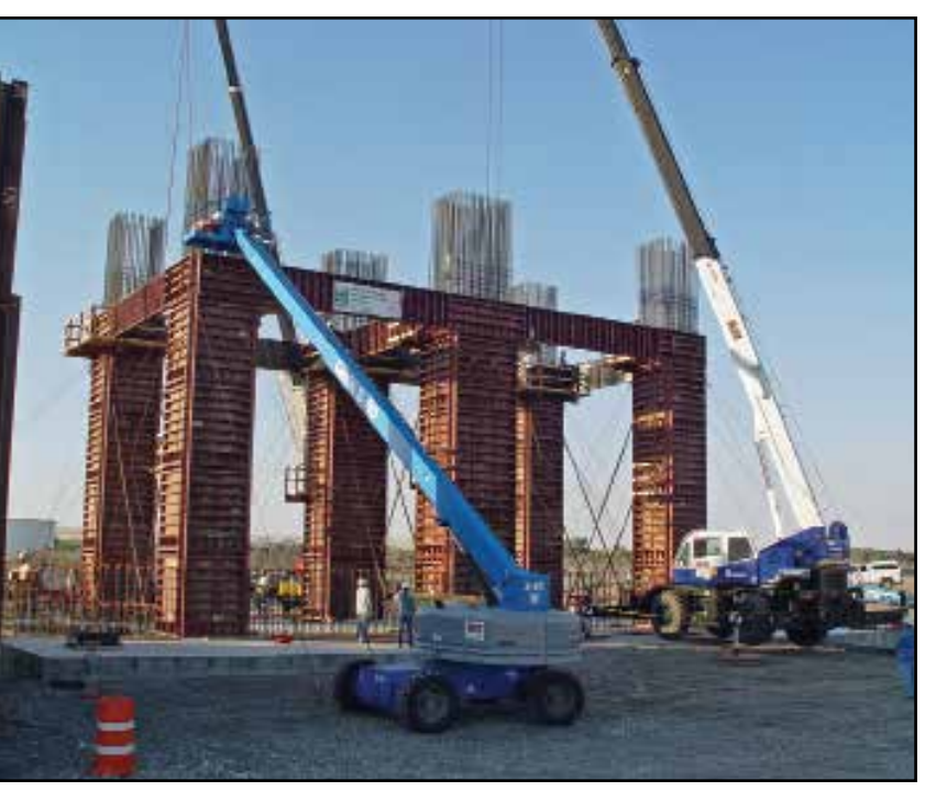
The second stage of the coker construction was the construction of the 36' tall, 6' \times 6' and 6' \times 8' , columns.