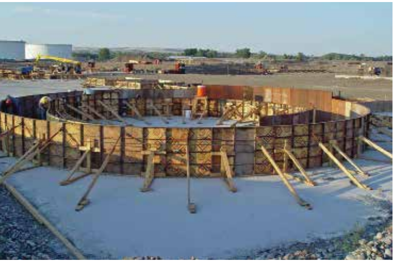
Panels 4' high formed the circular footing for a new storage tank at the facility.