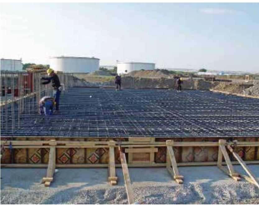
A new rail facility, electrical substation and control room featured concrete.