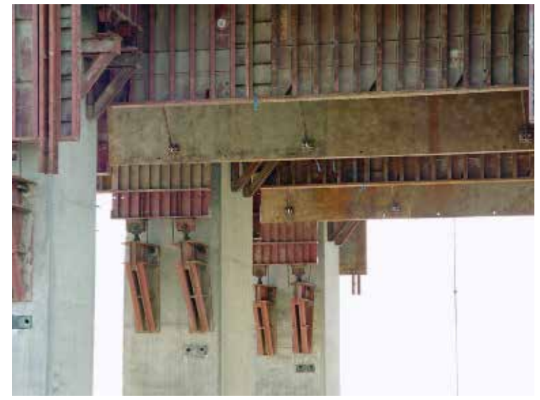
Column-mounted Anchor Brackets and self-spanning Max-A-Form capability eliminated conventional shoring.

Over 22 months, the project proceeded smoothly despite record precipitation totals in that area of the country. The project was complete at the end of 2007, and it earned the 2008 Excellence in Construction award for mega projects from Associated Builders and Contractors.