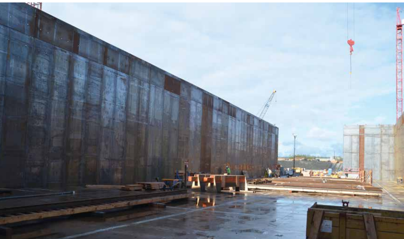
The project utilized custom-built precast forms for the pontoons.