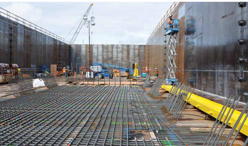
Coil She Bolts, Cast Coil Wing Nuts, Heavy Hex Coil Nuts, Coil Rod and Braces were used in the construction of the precast pontoon forms..