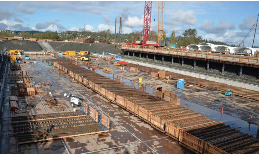
Casting bed for the largest pontoons ever built in Washington State.

In the construction of any pontoon bridge, maximum load is a crucial consideration. Pontoon bridges are constructed so that each pontoon is able to support a load (including the load of the bridge) equal to the mass of water displaced by the pontoon. The roadway built atop the pontoons must also be able to support these loads, yet be able to remain light enough so as not to affect the carrying capacity. Therefore it is imperative that products that are able to support the load capacities required, be incorporated in every aspect of the construction process.