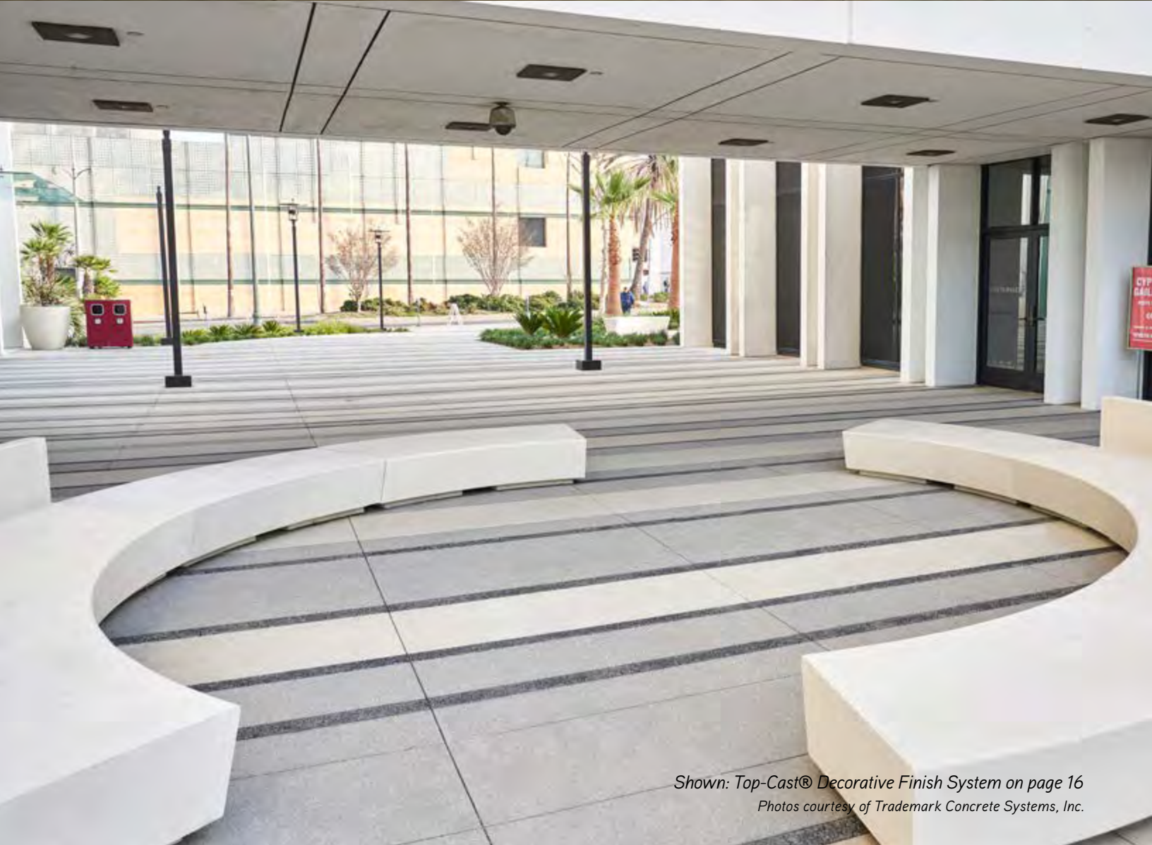
Shown: Top-Cast® Decorative Finish System on page 16