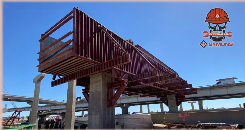
Photos of the 635 East Project under construction with the Symons forming system and accessories (top) and after the forms were removed (below)

moment loads and control deflection. This included custom 400 Kip offset support brackets to accommodate the 16' Soffits. The wide Soffit provided a safe working area for tying rebar, setting Inverted T Form and Post Tensioning.