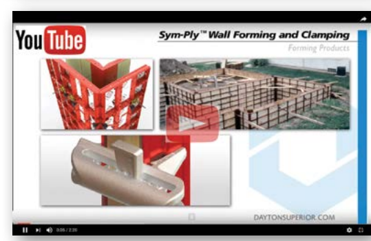
Watch the video at www.youtube.com/watch?v=p2dZbjVltZk