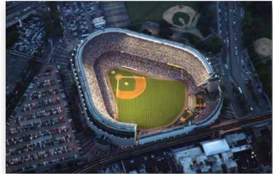
Dayton Superior is proud to have participated in the building of the world famous New Yankee Stadium in the Bronx, NY. Precast used in projects of this scale assist in securing accelerated project completion incentives.