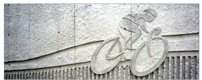
Dayton Superior quality and support virtually guarantee budget-friendly customer satisfaction.