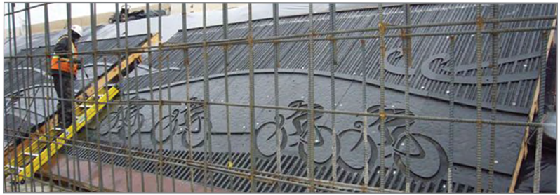
Choose formliners for cost-effective detail and quality.

Detailed drawings before approval make sure everyone is on the same page before work begins.